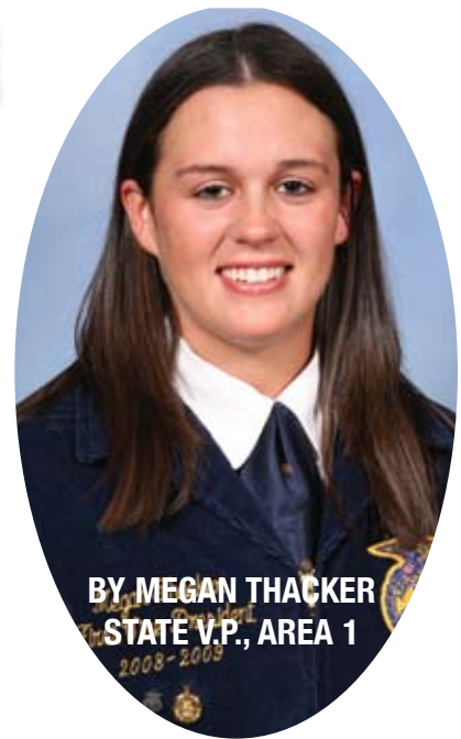
BY MEGAN THACKER STATE V.P., AREA 1

As FFA members you can make a difference any time, any place. Although your name may