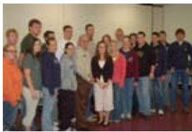
Ag Leadership Class

Thank you for joining us at the 2008 Ag Expo