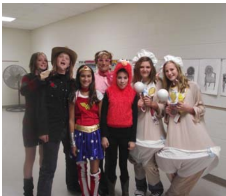
Midway students wearing their costumes for the March of Dimes

The halls of Midway High School were a bit spookier than normal on Friday, October 29, 2010. Students wore their Halloween costumes to school as a fundraiser for the March of Dimes, an organization dedicated to improving the health of babies by preventing birth