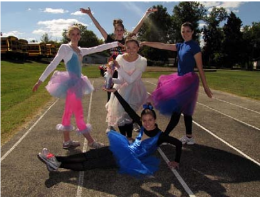
The Jackson Ballerinas

decorated the track when Scott City FBLA hosted