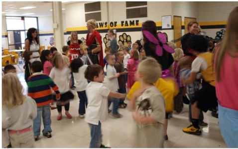
Pictured are some of the High School Students dancing at the Sock-Hop with the Kindergarteners.

Friday October 29 high school students from Cassville FBLA traveled to the Cassville Primary School and spoke to the kids about Halloween safety. The high school students dressed up in