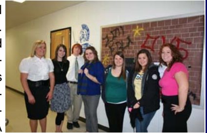
Oran's local officers preparing for the Career Fair

very impressed with his speech. Students attended the keynote opening, four sessions and a closing session. For the closing session, FBLA officers conducted an office Olympics. All who attended agreed that the Career Fair was a success. The Oran FBLA chapter will continue to have it throughout the years.